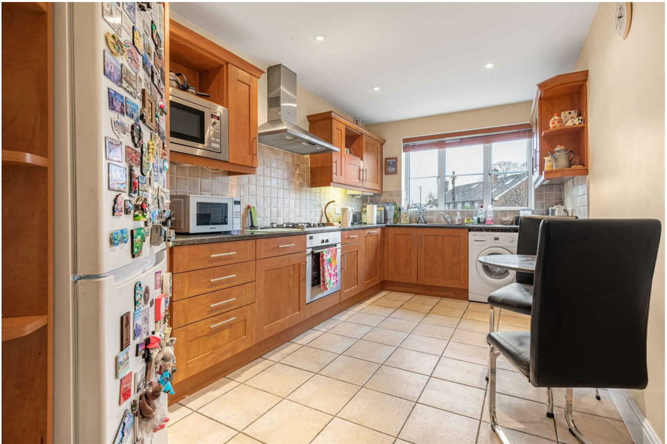
KITCHEN / BREAKFAST ROOM (PIC 2)

Double glazed window to the front, spotlights to the ceiling, tiled flooring and fitted with ample medium oak wall and base units adorned with granite worktops and tiled splashbacks. Integrated dishwasher, Siemens gas hob, under counter oven and Chimney extractor above, stainless steel sink with mixer tap. Space for a tall fridge/freezer and plumbed for washing machine.