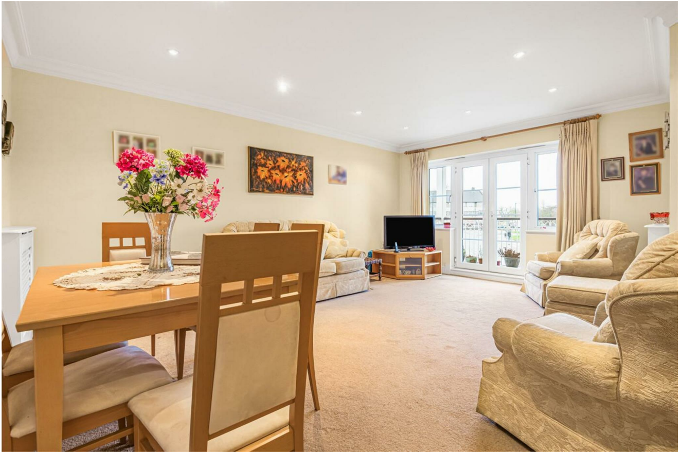
PRIVATE SOUTH-FACING BALCONY 12'10 x 5'8 (3.91m x 1.73m) Accessed from the Lounge through the double glazed french doors on to the 12ft south-facing private balcony with cast-iron balustrade and wooden decked flooring.