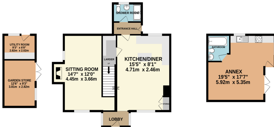
GROUND FLOOR 1219 sq.ft. (113.2 sq.m.) approx.