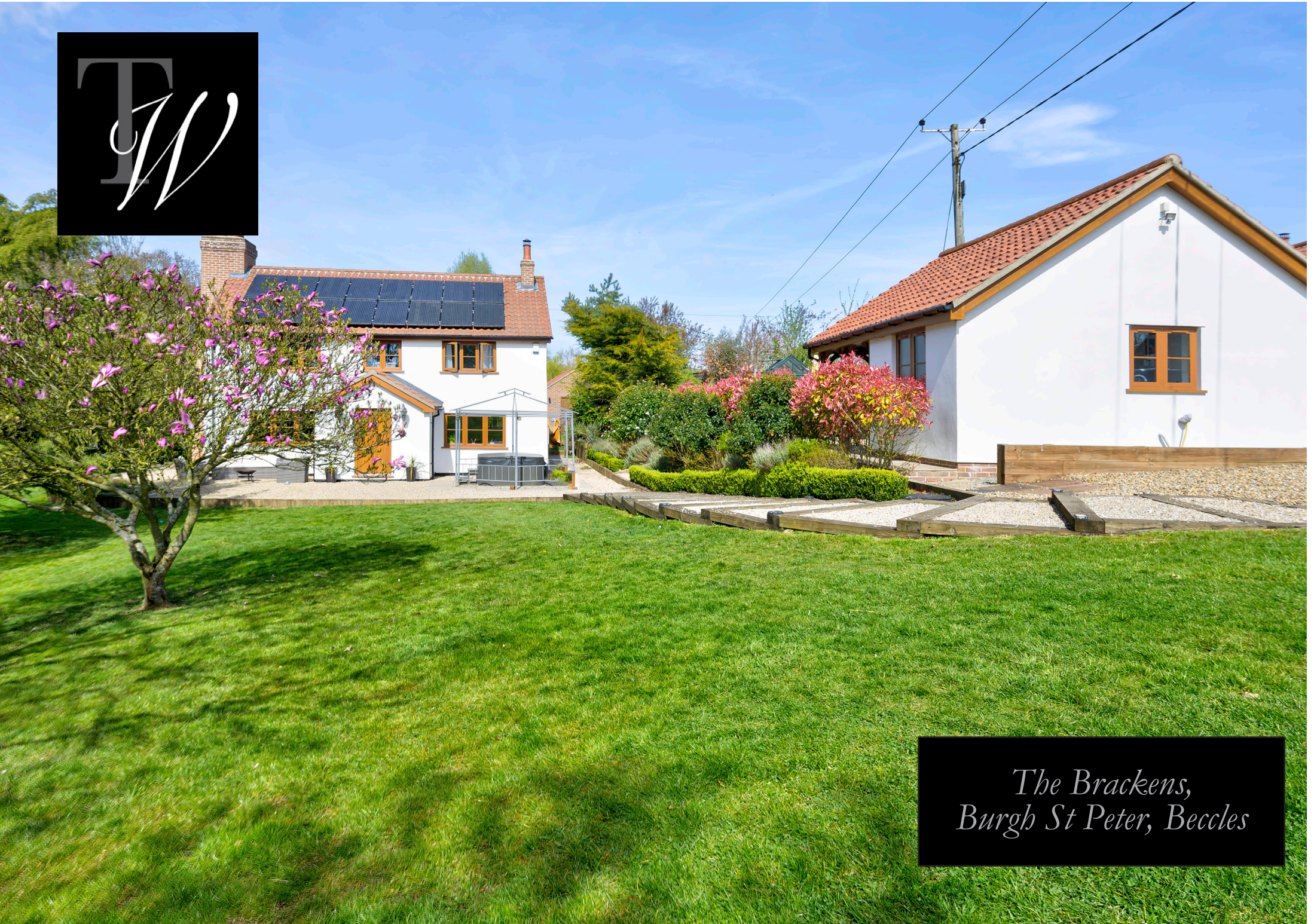
The Brackens, Burgh St Peter, Beccles