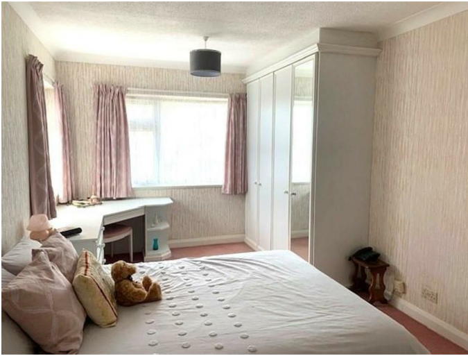
DUAL ASPECT GROUND FLOOR BEDROOM 17'4" x 9'10" (5.29m x 3.00m)