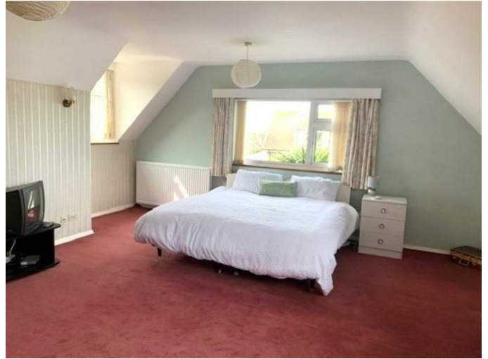
TRIPLE ASPECT BEDROOM 17'2" x 15'10" (5.25m x 4.83m)

Access to eaves storage and loft access. Large walk in airing cupboard with hot water tank and shelving.