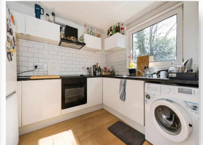
Juniper Court, Bitterne Road West, Southampton SO18 1BN