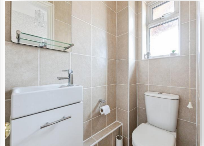
The Hollies, Wellingborough NN8 3GA