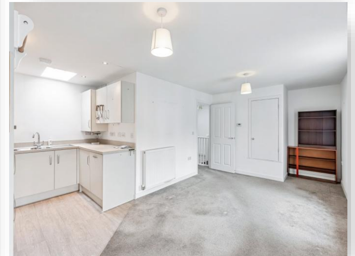
Waterside Road, Wellingborough NN8 1PD