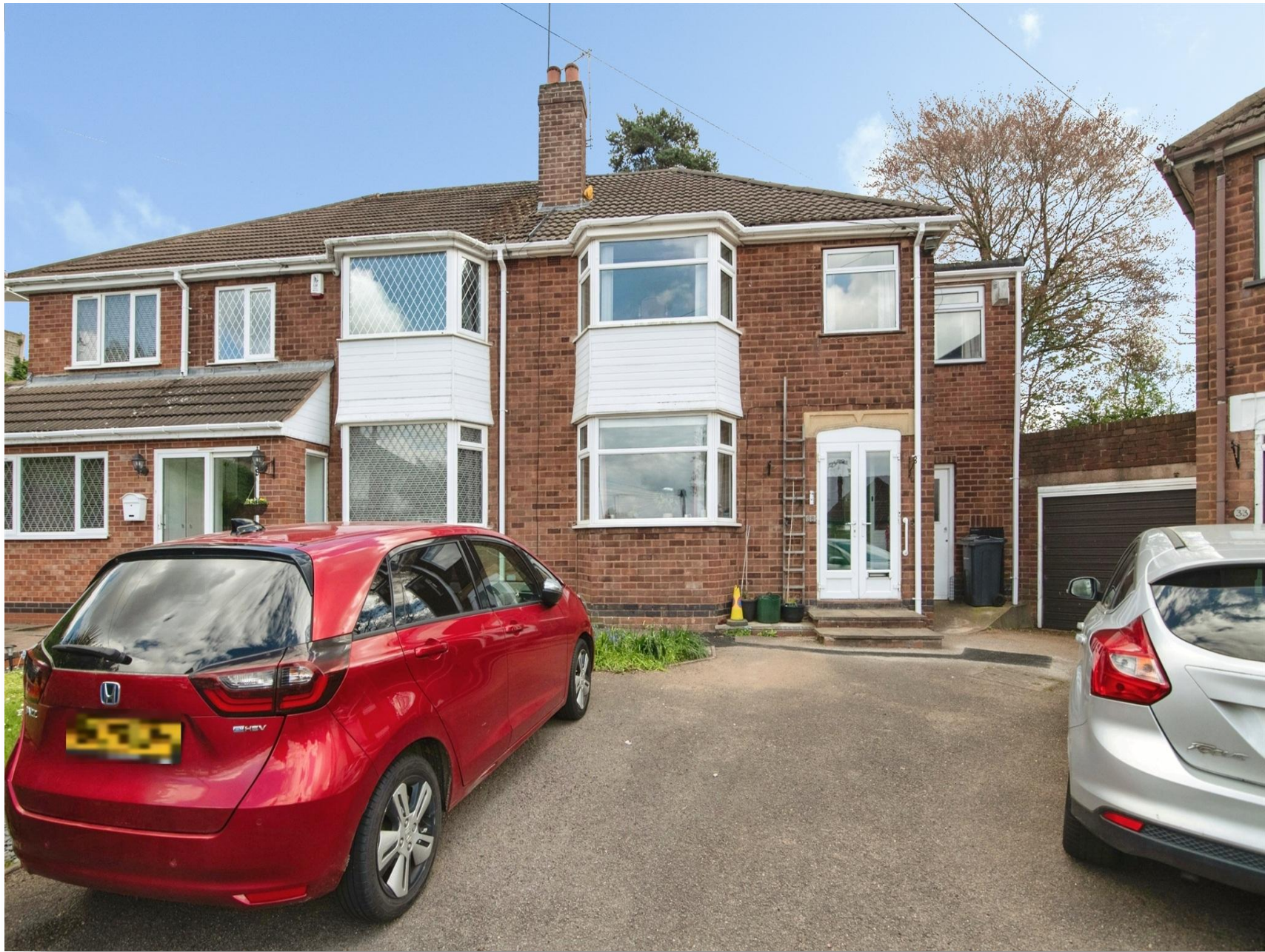
Medcroft Avenue, Birmingham B20 1NB