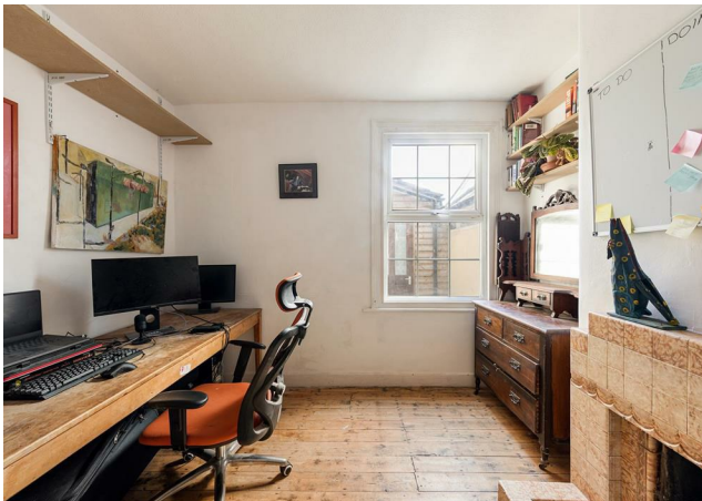
Reception Room 13'3" x 10'5"