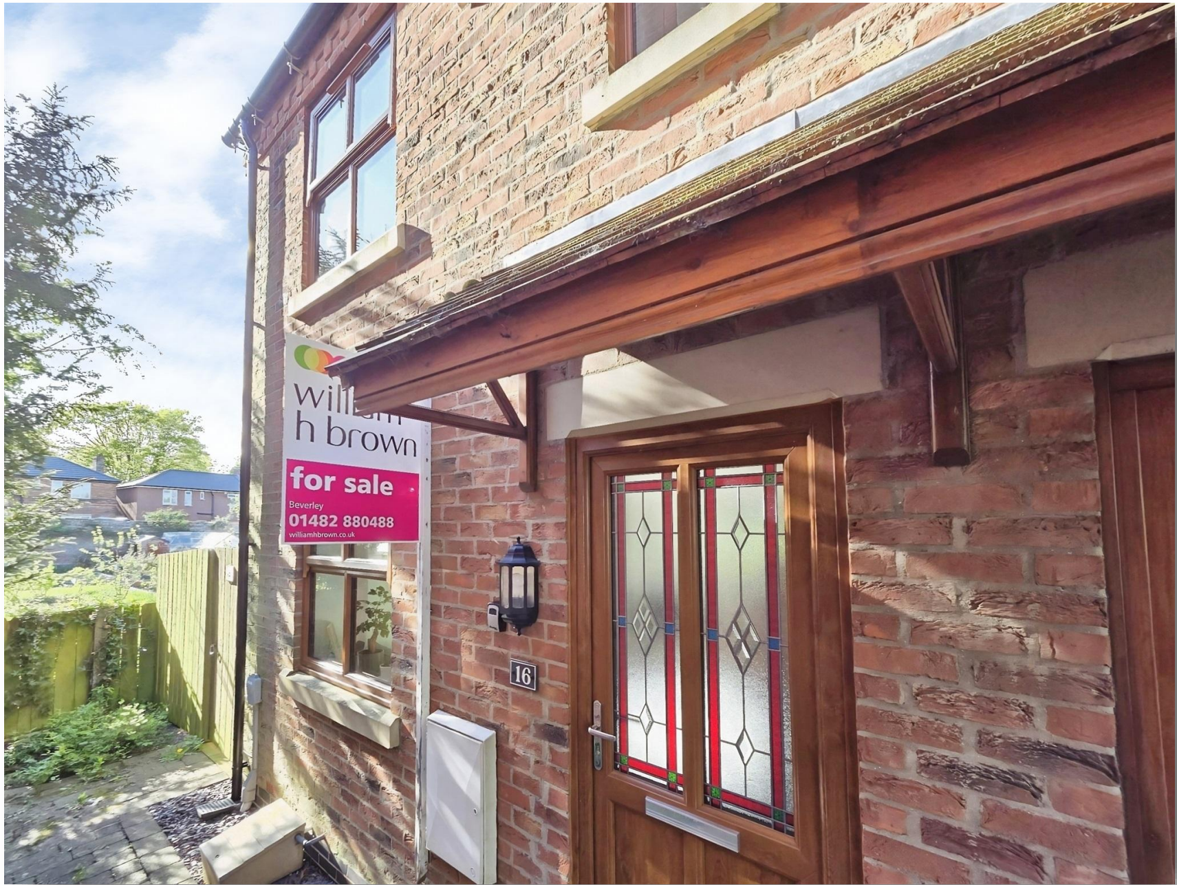
Keldgate Close, Beverley, HU17 8JE