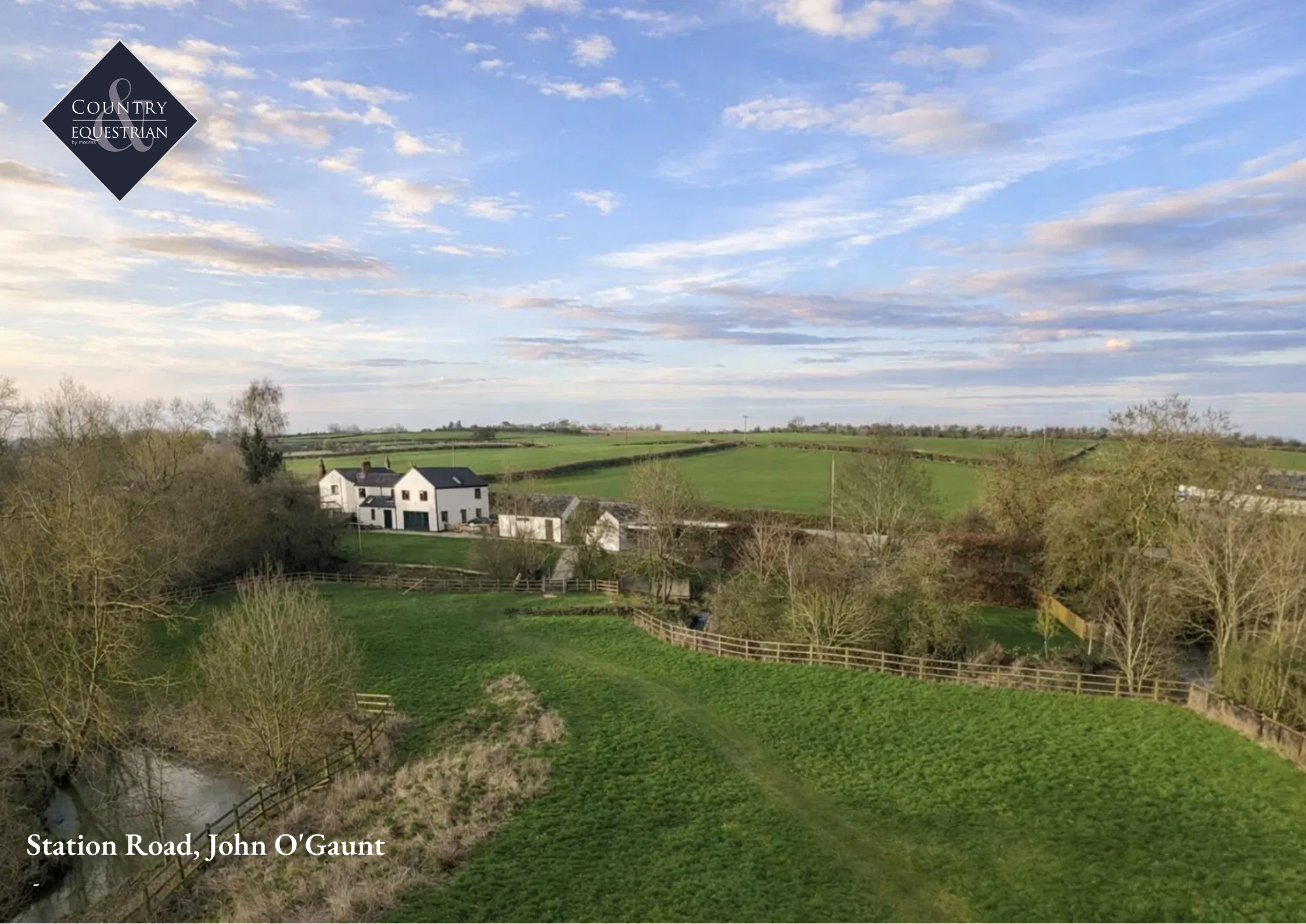
Station Road, John O'Gaunt