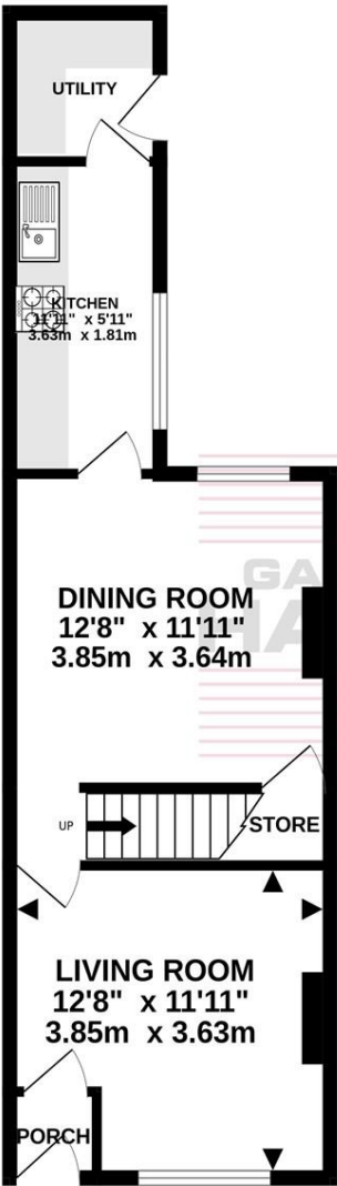
GROUND FLOOR 438 sq.ft. (40.7 sq.m.) approx.