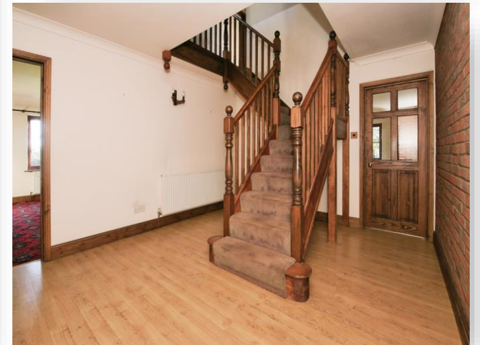
Bridge Farm, Euximoor, Christchurch PE14 9LP