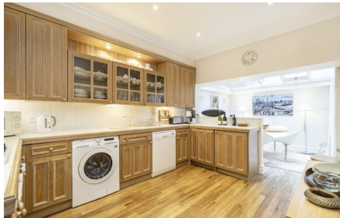
Bina Gardens, SW5