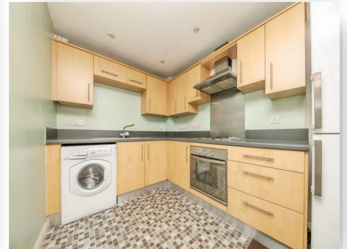
Yeoman Close, Ipswich, IP1 2QE