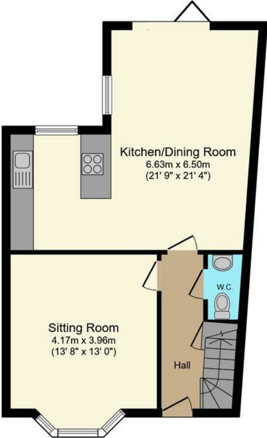
Ground Floor Floor area 53.4 sq.m. (575 sq.ft.)