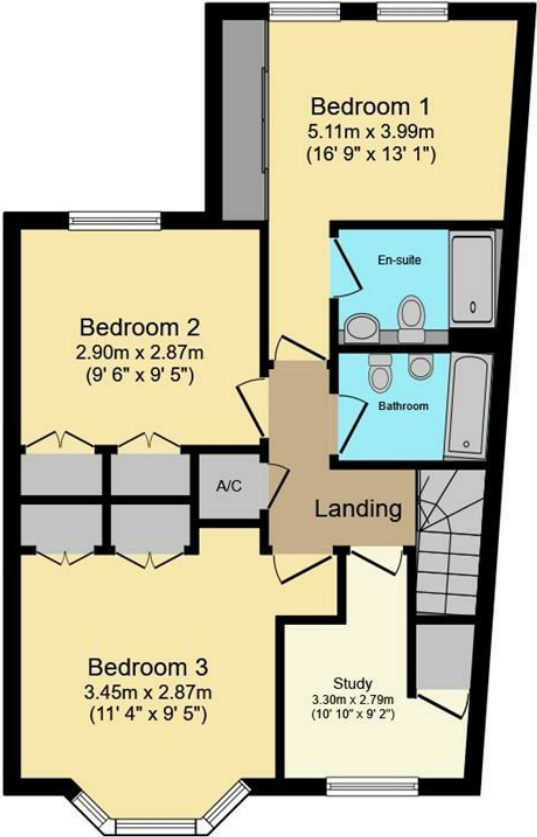
First Floor Floor area 53.4 sq.m. (575 sq.ft.)

Total floor area: 106.9 sq.m. (1,150 sq.ft.)