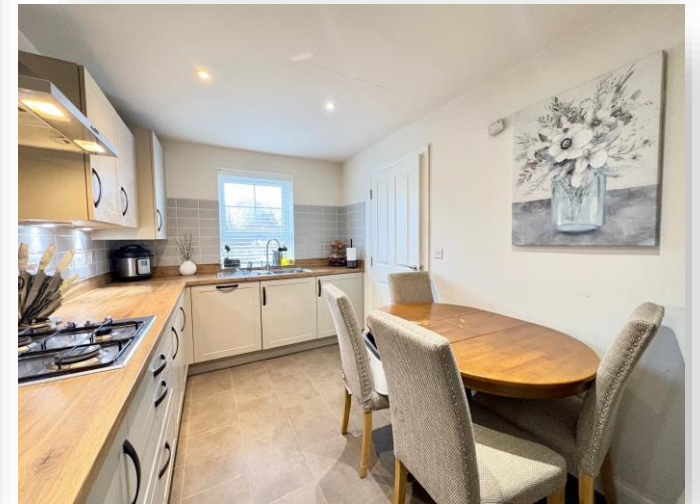
Higgs Close, Overstone Northampton NN6 0RT