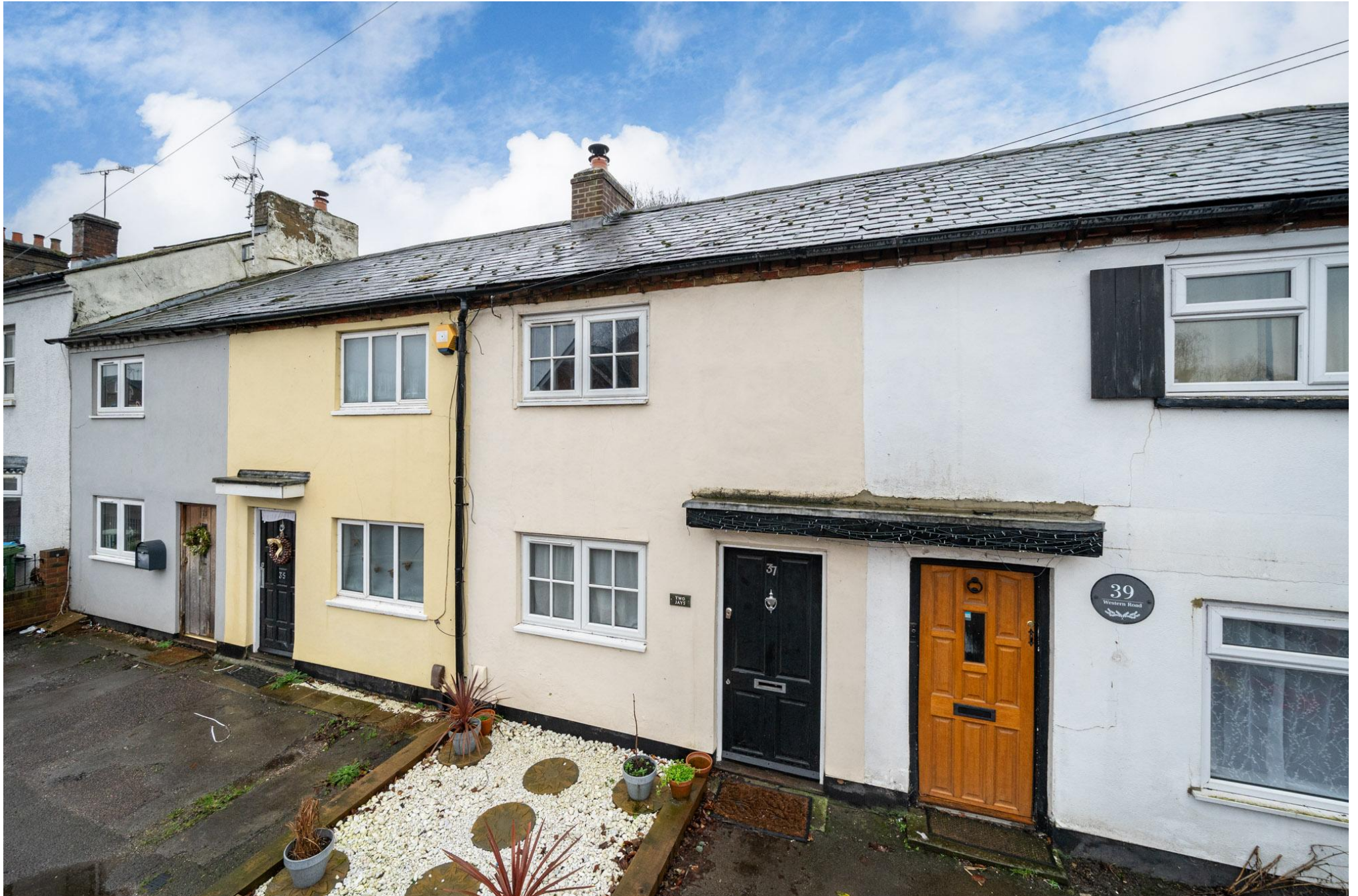
WESTERN ROAD, TRING HP23 4BQ