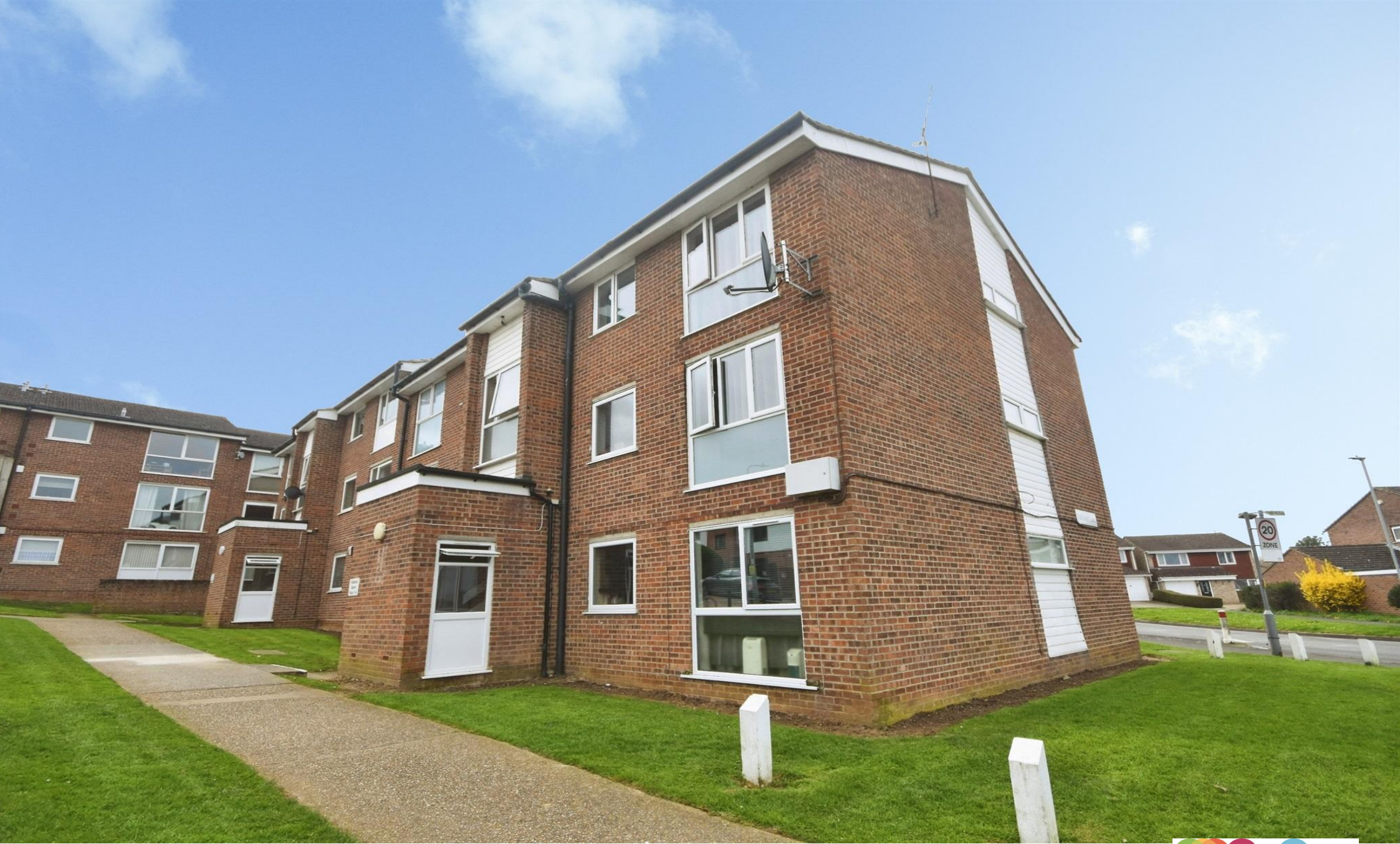
Falkland Court, Braintree, CM7 9LL