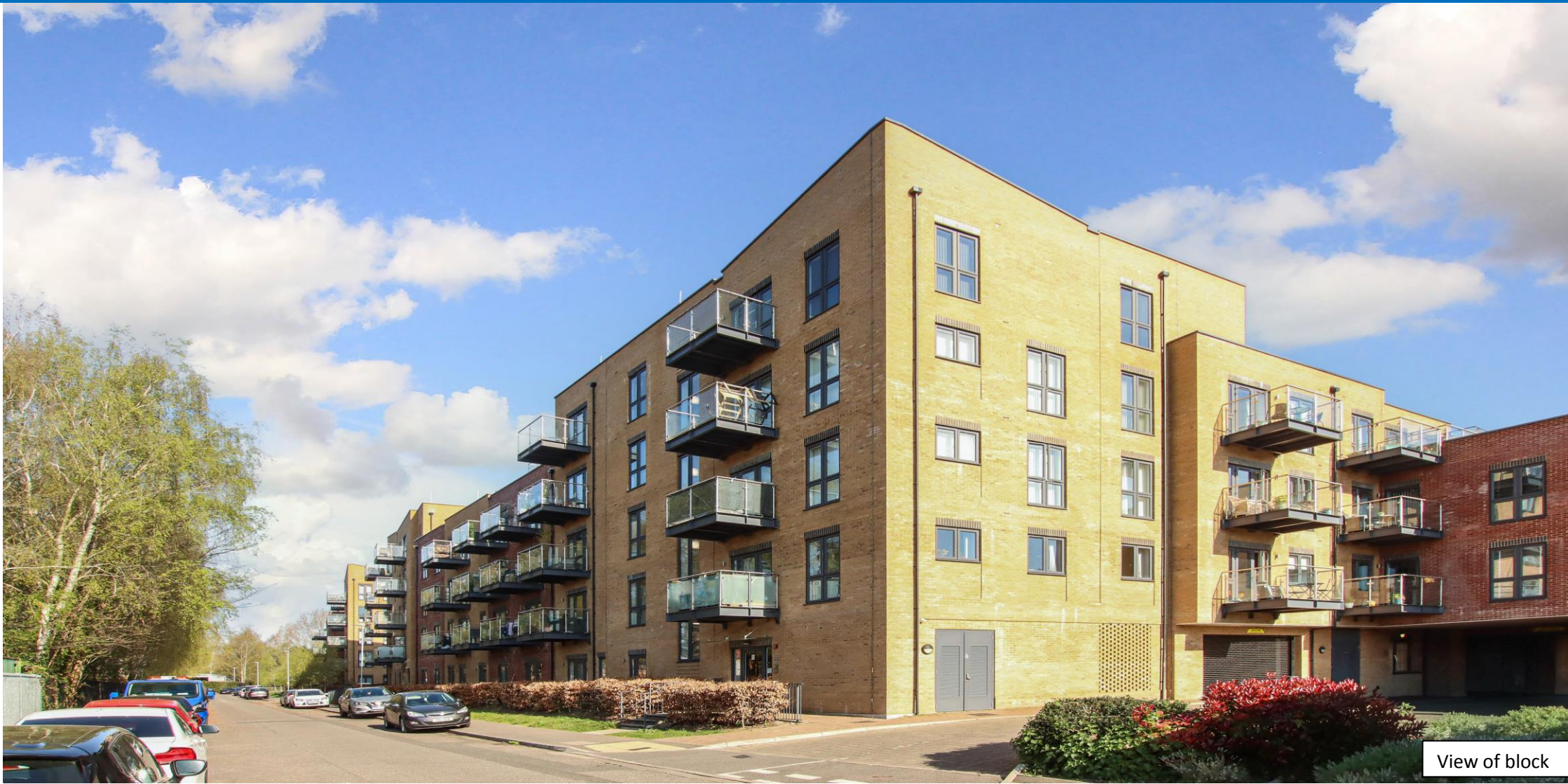
View of block