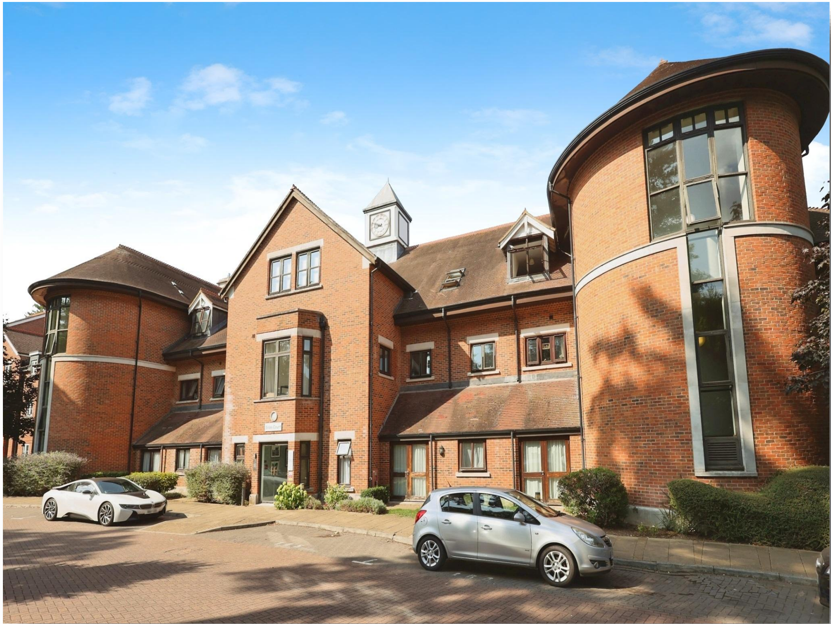
Silas Court, Lockhart Road, Watford, WD17 4BQ