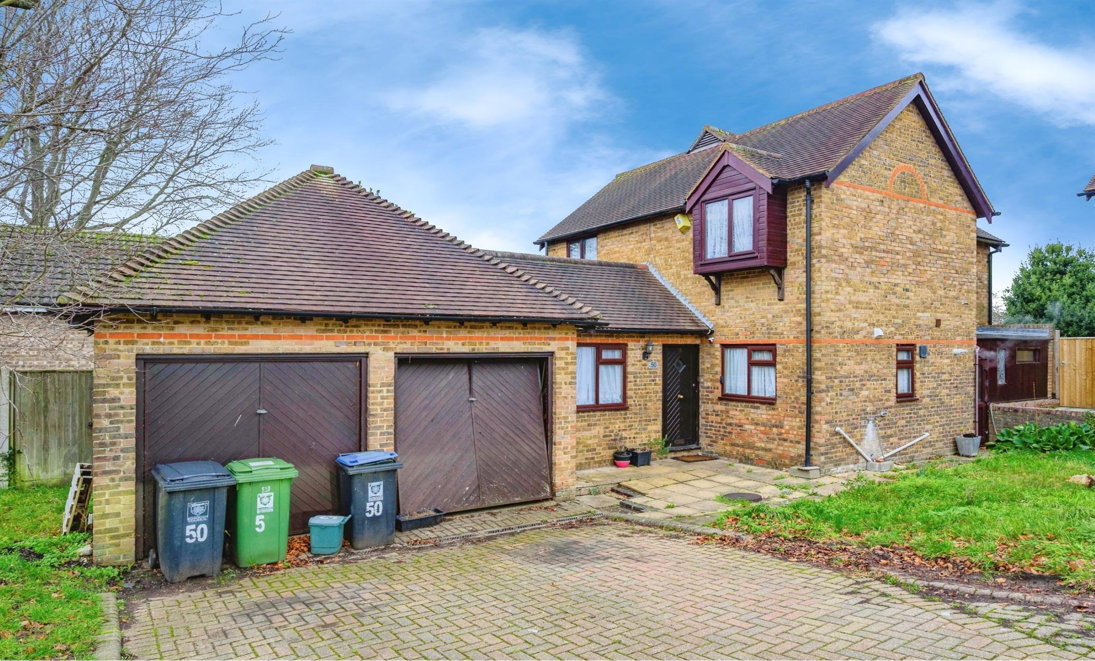
Walnut Grove, Hemel Hempstead HP2 4AP