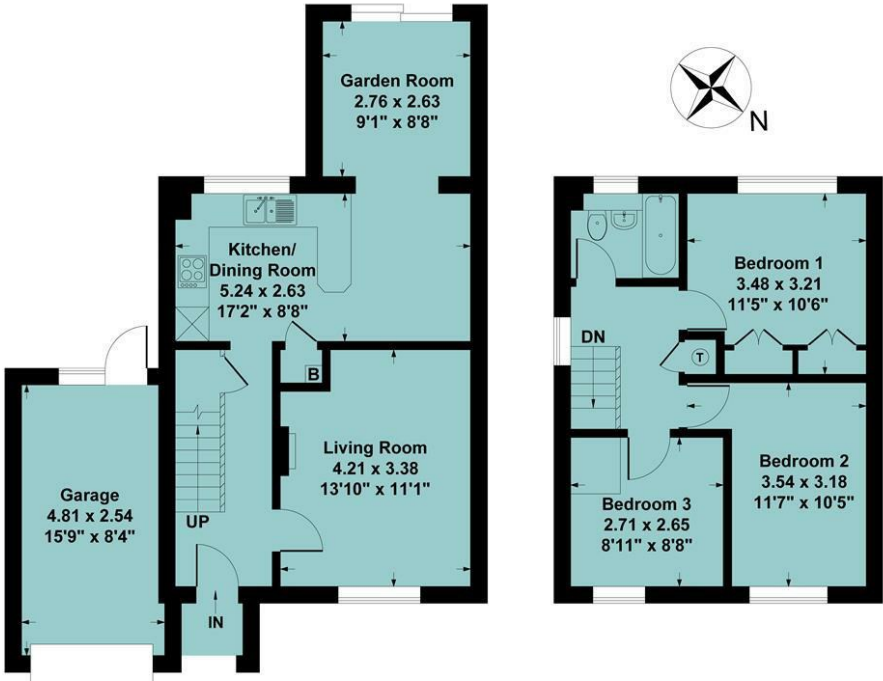
Garage Ground Floor First Floor

Anker and Partners earn supplementary income from various sources relating to the provision, referral and introduction of services and products to our clients and customers. This may be in the form of a fixed fee or a percentage of a premium, fee or invoice. This is not done in all cases and use of these providers/suppliers is not mandatory. Clients are entirely free to choose their own products, services and providers. We declare this intention within our Terms of Business and by signing these documents our clients and customers confirm their agreement in doing so.