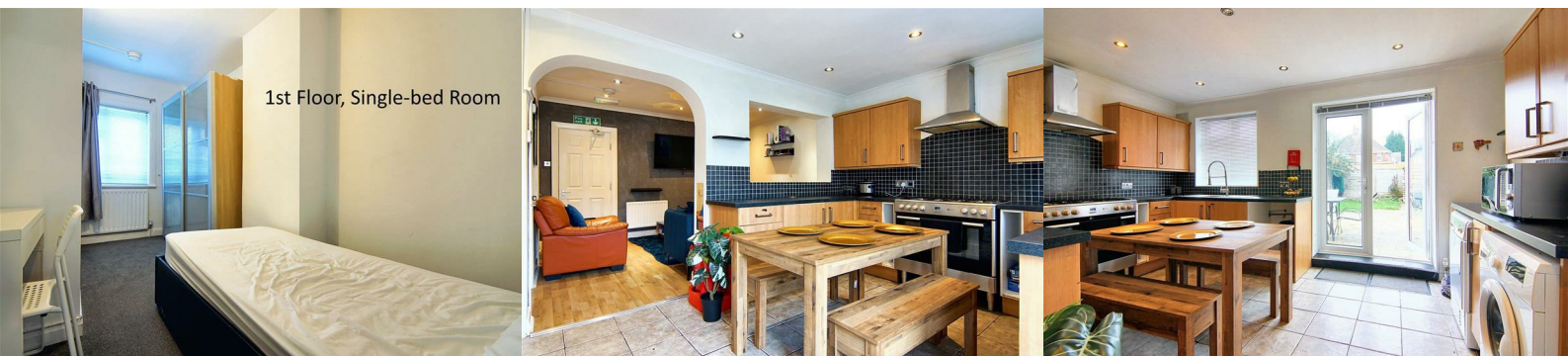
1st Floor, Single-bed Room