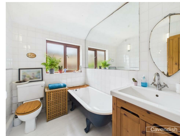
FAMILY BATHROOM 2.57m x 1.80m (8'5" x 5'11")

Hardwood framed double glazed window, ceiling light point, picture rails, and double radiator with thermostat.