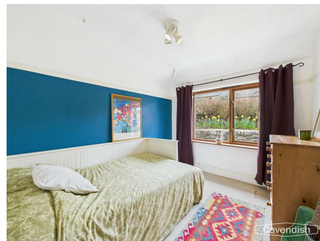
BEDROOM THREE 3.12m x 2.69m (10'3" x 8'10")

Hardwood framed double glazed window, picture rails, double radiator with thermostat, and exposed wooden floorboards.