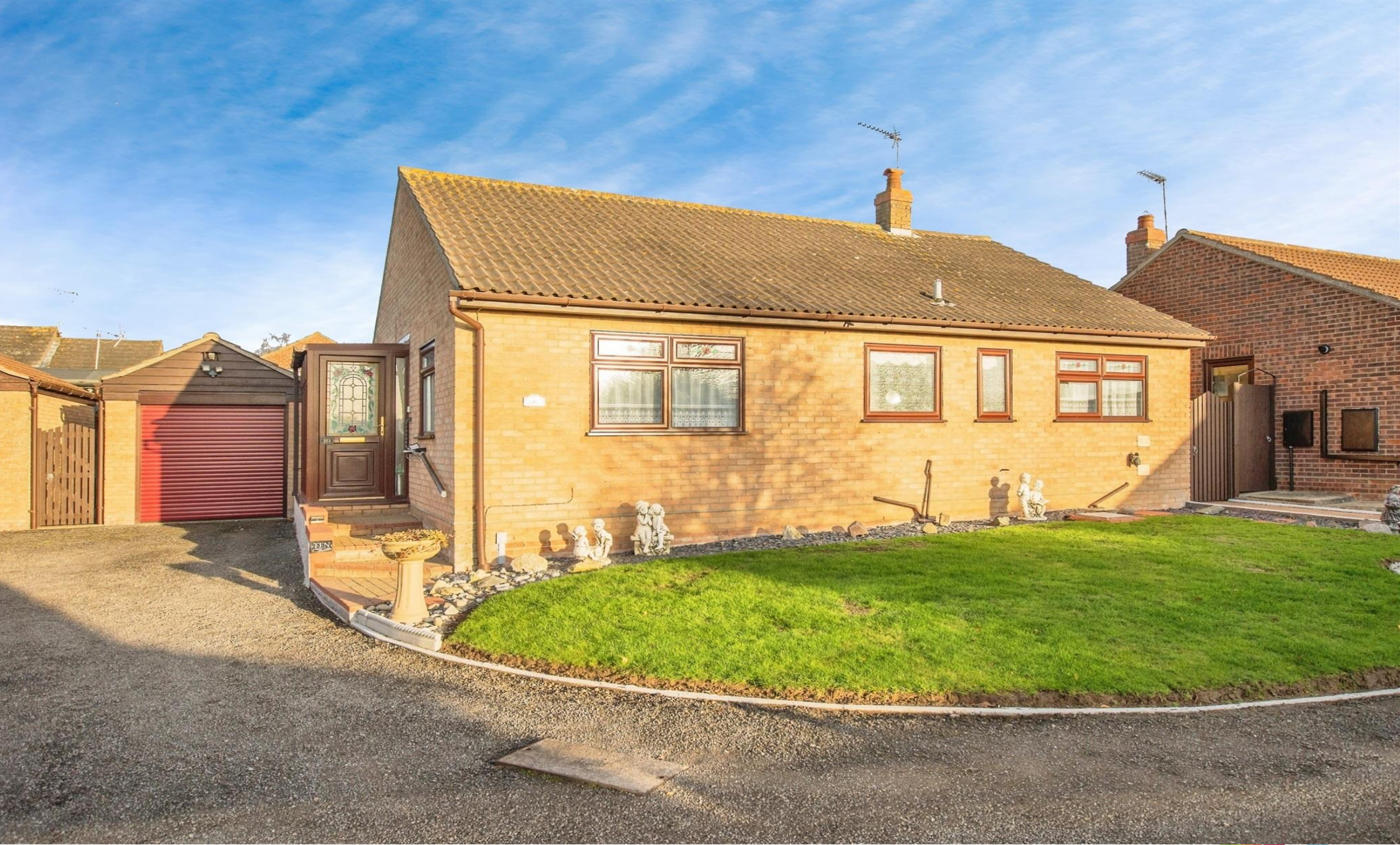
George Close, Clacton-On-Sea CO15 1EF