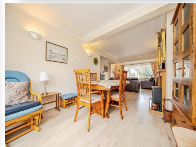
Manor Road, Ipswich, IP4 2UX