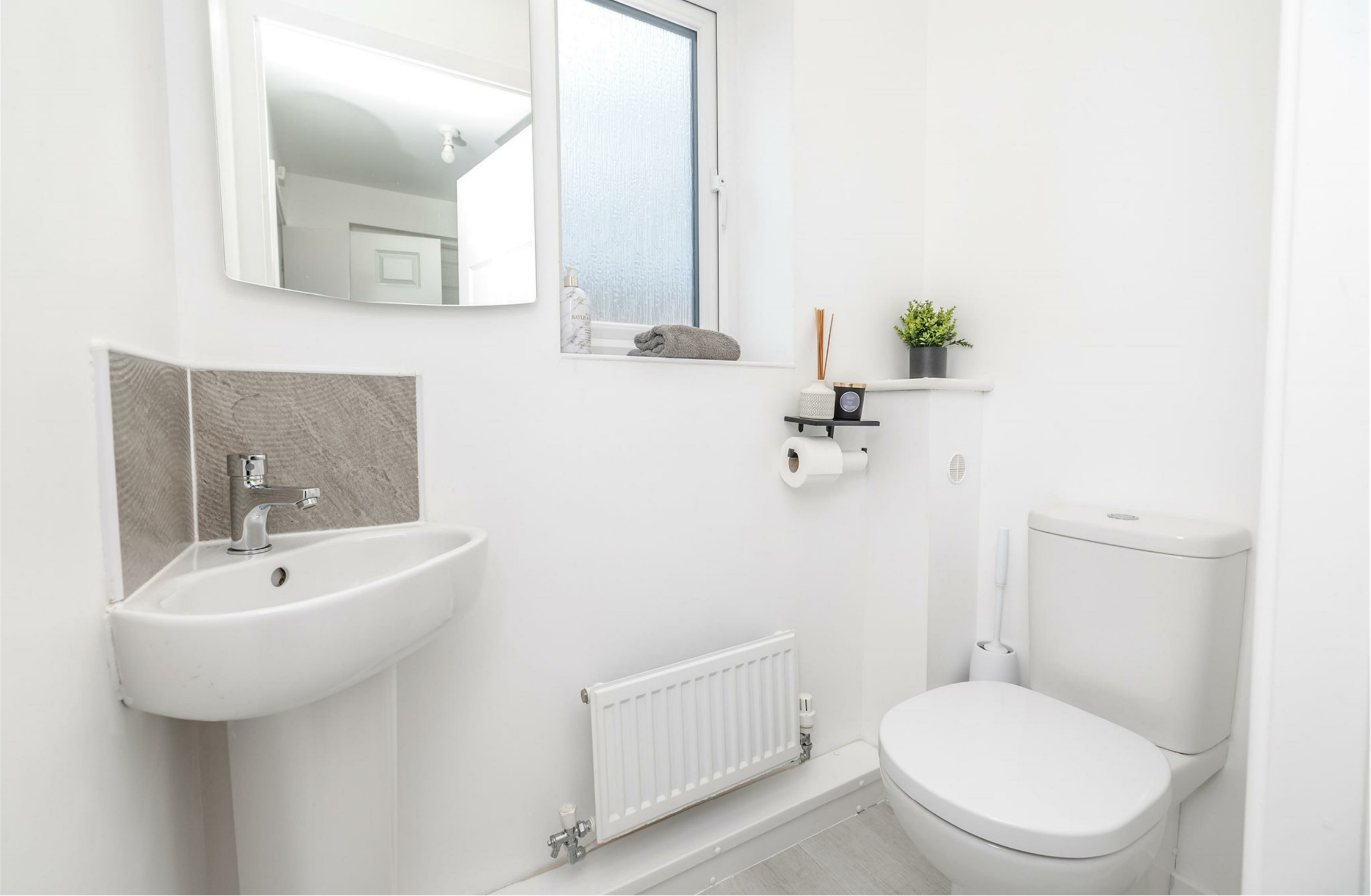
36 Speckledwood Way, Newcastle Great Park, Newcastle Upon Tyne, NE13 9ED