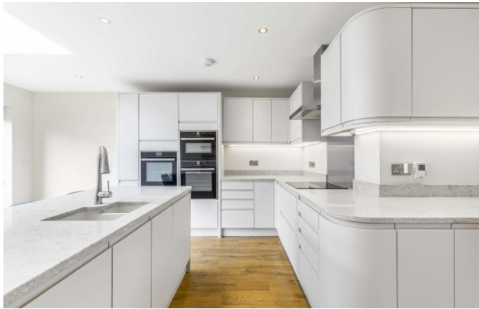
Herbert Road, KT1