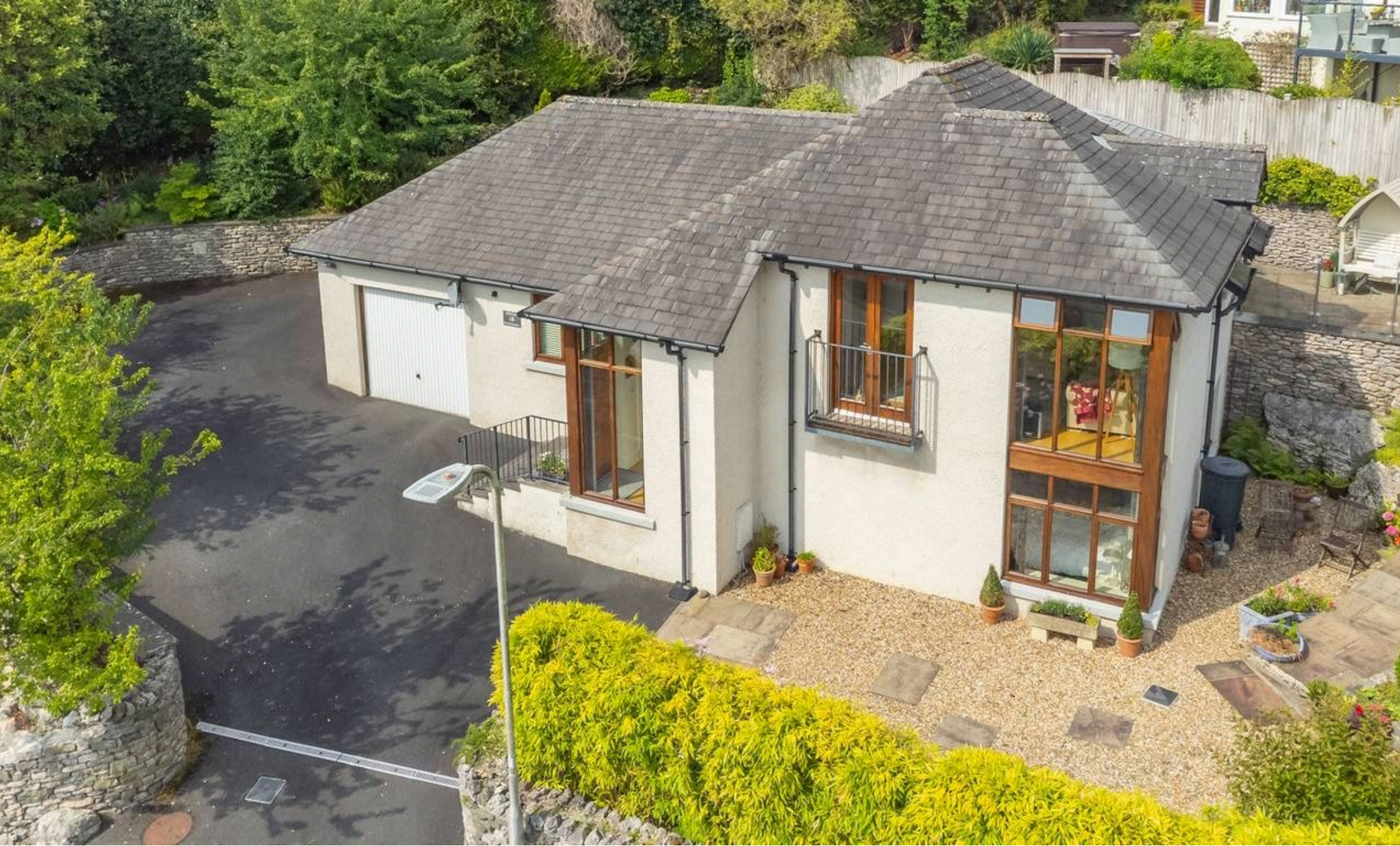
Mill Croft, 18 The Old Nurseries, Grange-Over-Sands £650,000