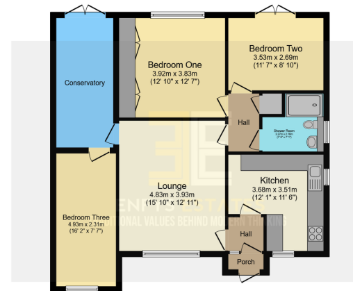
Floor Plan Floor area 89.0 sq.m. (958 sq.ft.)

Total floor area: 89.0 sq.m. (958 sq.ft.)