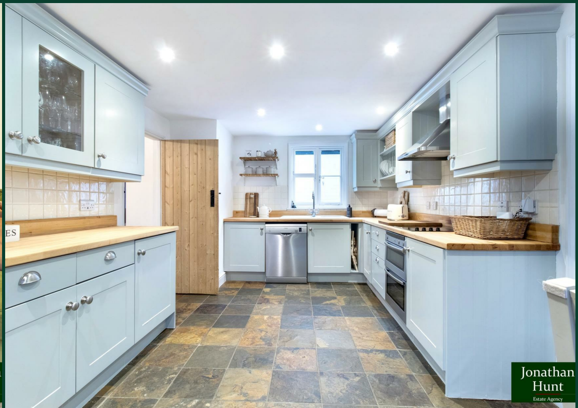
Jonathan Hunt Estate Agency