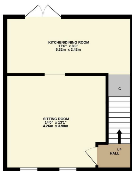
GROUND FLOOR 367 sq.ft. (34.1 sq.m.) approx.