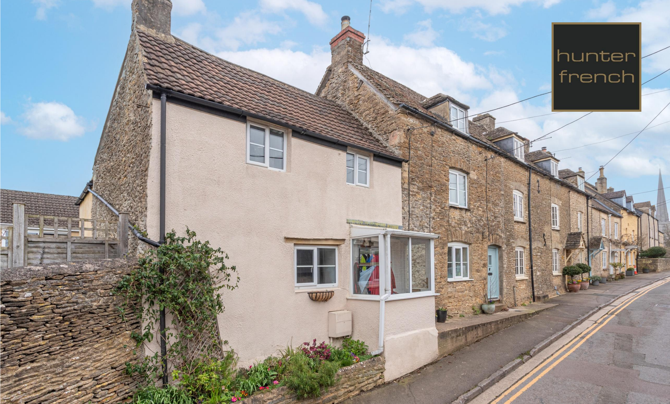
95 West Street, Tetbury, Gloucestershire, GL8 8DR