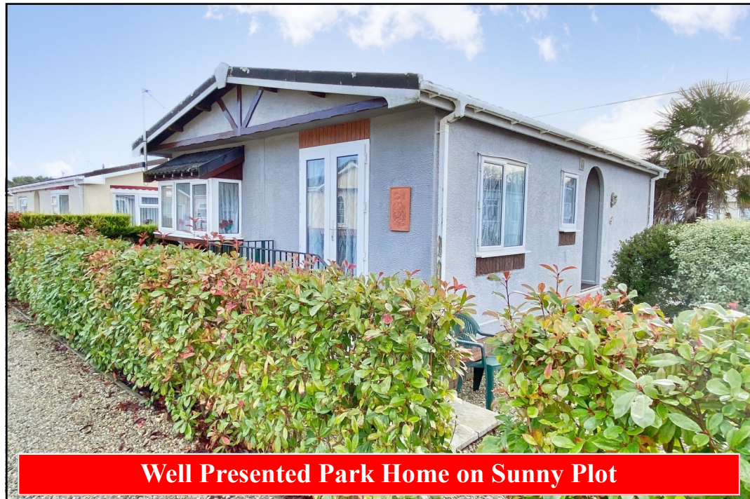
Well Presented Park Home on Sunny Plot

44 Holton Heath Park, Wareham Road, Holton Heath, Poole. BH16 6JS