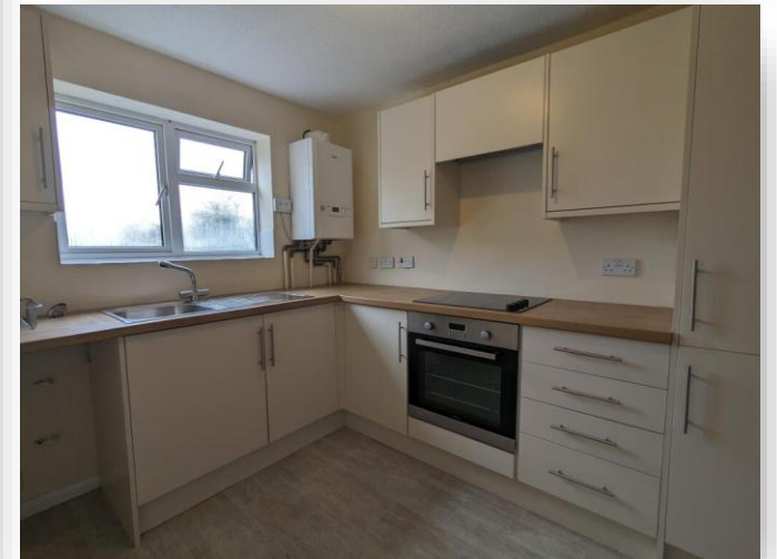
Wood Lane, Chippenham, SN15 3EA