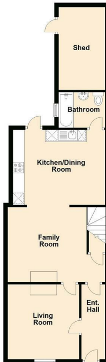
Ground Floor Approx. 60.8 sq. metres (654.6 sq. feet)