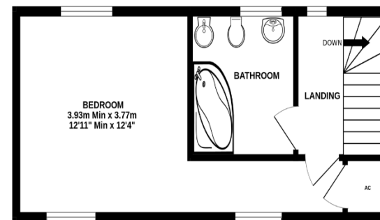
TOTAL FLOOR AREA : 82.5 sq.m. (888 sq.ft.) approx.

Whilst every attempt has been made to ensure the accuracy of the floorplan contained here, measurements of doors, windows, rooms and any other items are approximate and no responsibility is taken for any error, omission or mis-statement. This plan is for illustrative purposes only and should be used as such by any prospective purchaser. The services, systems and appliances shown have not been tested and no guarantee as to their operability or efficiency can be given. Made with Metropix ©2026