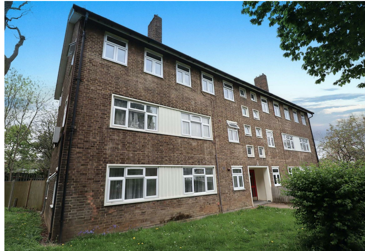
Corbett Grove, London, N22 8DQ

Offers are invited on this 2 bedroom apartment situated on the ground floor of this purpose built block and within walking distance of Bounds Green Tube Station (Piccadilly Line) and less than a mile to Alexandra Park and Palace, with local amenities also within close proximity.