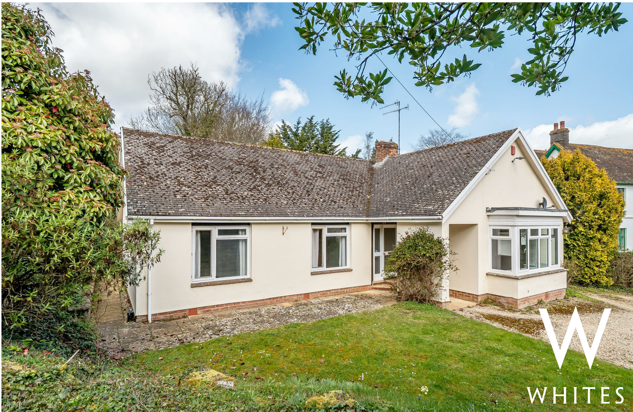
The Little House Warminster Road, Stapleford, Salisbury, SP3 4LT