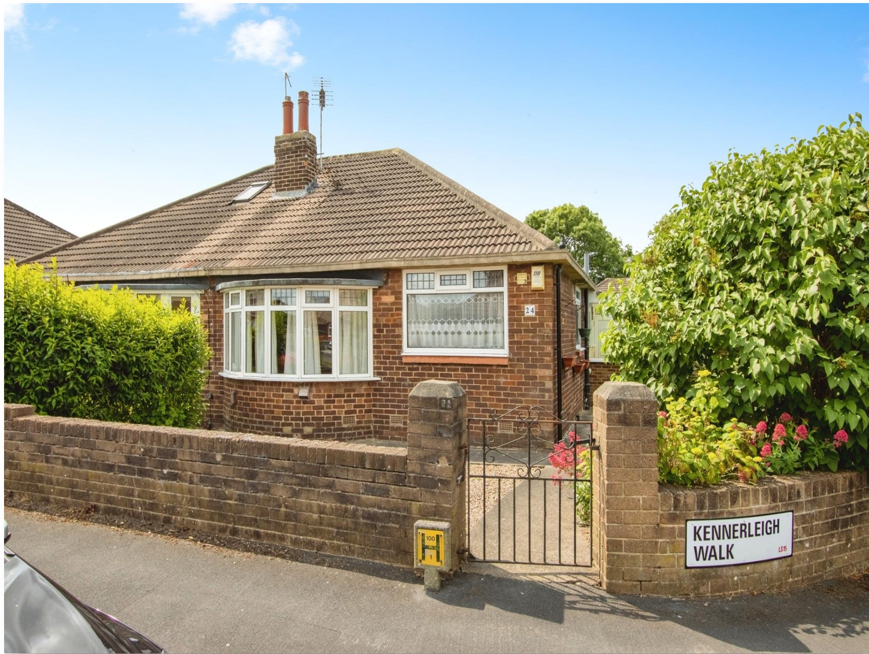
Kennerleigh Walk, Leeds LS15 8RL