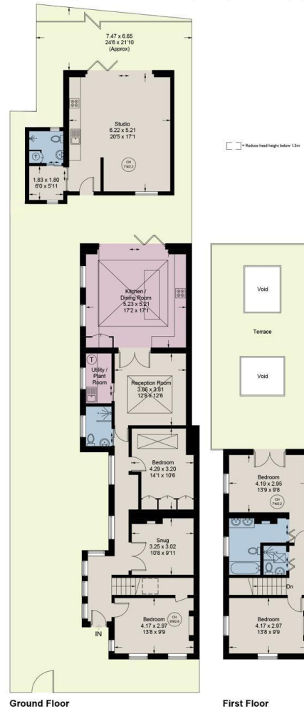
Illustration for identification purposes only, not for valuation purposes, measurements are approximate, not to scale.

Chesterton UK Services Limited trading as Chestertons for themselves and for the vendor of this property whose agents they are, give notice that (i) these particulars do not constitute any part of an offer or contract, (ii) all statements contained within these particulars are made without responsibility on the part of Chestertons or the vendor, (iii) whilst made in good faith, none of the statements contained within these particulars are to be relied upon as a statement or representation of fact, (iv) any intending purchasers must satisfy themselves by inspection or otherwise as to the correctness of each of the statements contained within these particulars, (v) the vendor does not make or give either Chestertons or any person in their employment any authority to make or give representation or warranty whatsoever in relation to this property. Wide angle lenses may be used. ©Copyright Chestertons | Chesterton UK Services Limited | Registered Office 5th Floor, The Lantern, 75 Hampstead Road, London, NW1 2PL Registered Company Number 05334580.