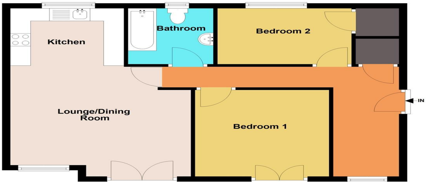
Ground Floor Approx. 62.9 sq. metres (676.6 sq. feet)

Total area: approx. 62.9 sq. metres (676.6 sq. feet) 4 Riverbank Avenue