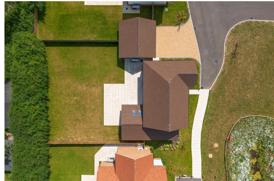
JASMINE COTTAGE - HOME 2 4-BEDROOM, DETACHED

This development is simply beautiful, with just 17 homes located in a quintessentially Kentish village with a community spirit and a great pub at the heart. Come and visit to fully appreciate just how extraordinary this home is.