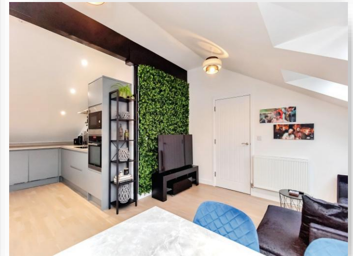
Butler Court, Fairfields Drive, Ramsey PE26 1NQ