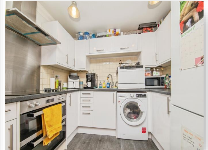
Simon House, St. Marys Road, Ipswich, IP4 4SP