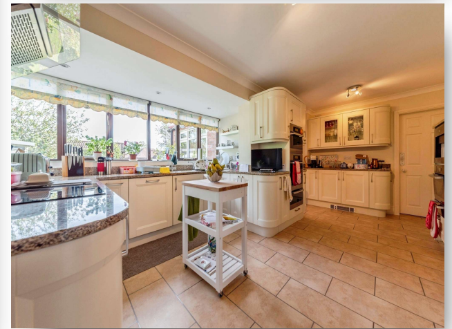
Hampton Lodge Grays Court, Farndon Newark NG24 3UD