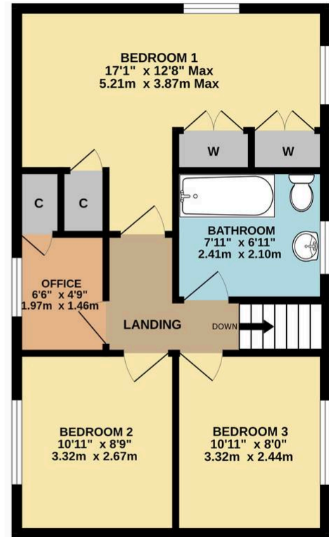
1ST FLOOR 449 sq.ft. (41.7 sq.m.) approx.