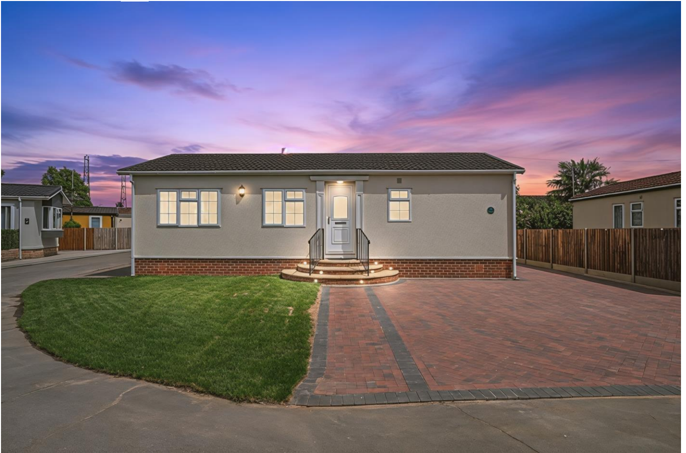
40 New Site Weybridge Park Estate Addlestone Surrey KT15 2RG