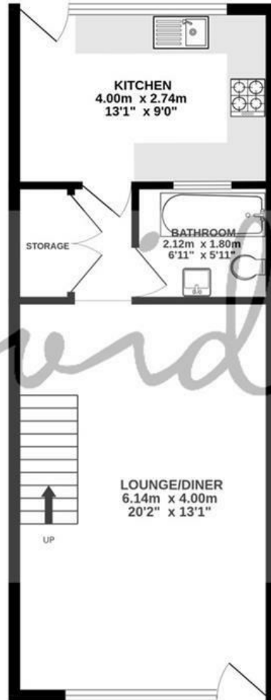
GROUND FLOOR 42.7 sq.m. (459 sq.ft.) approx.