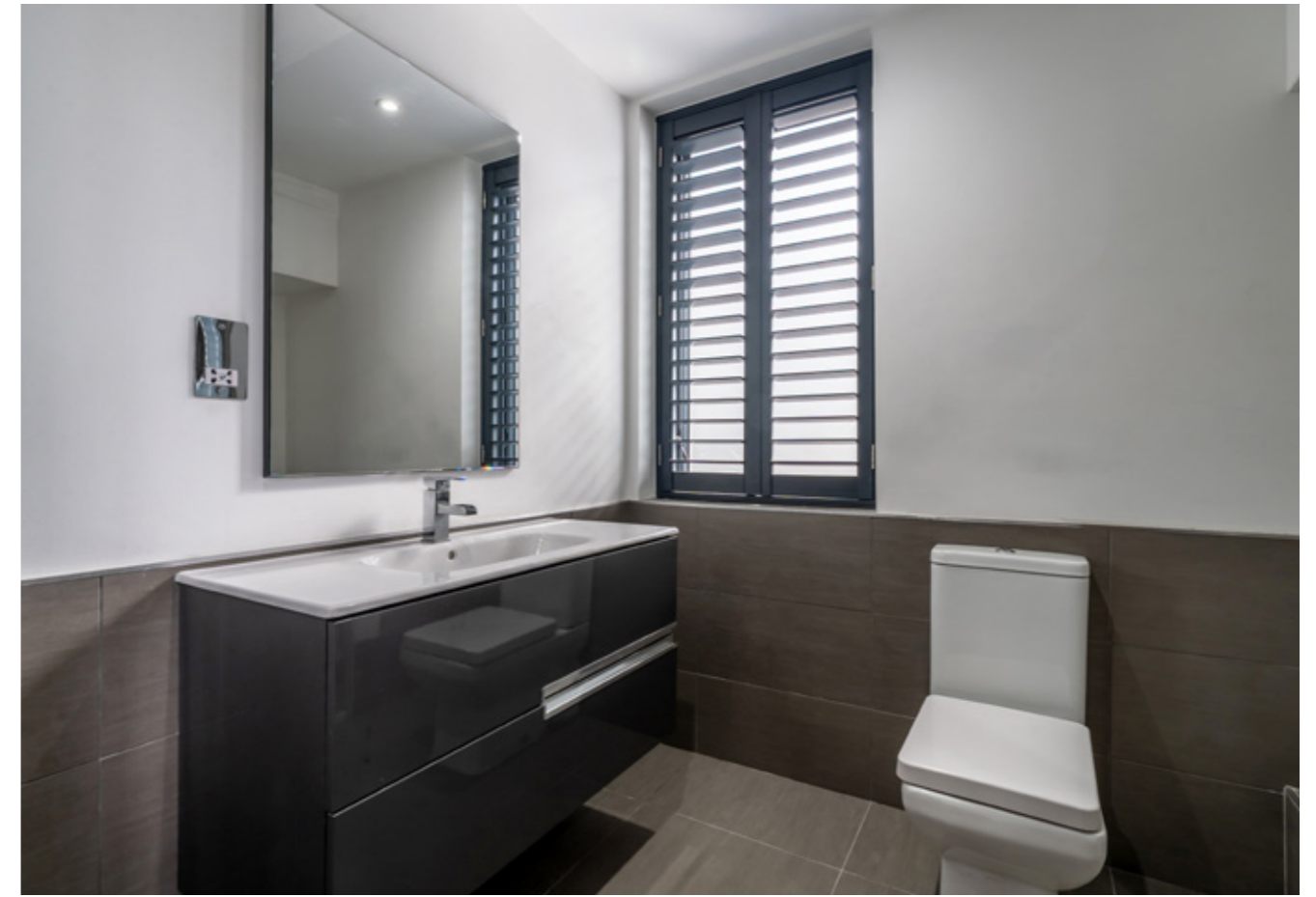
MASTER EN-SUITE SHOWER ROOM