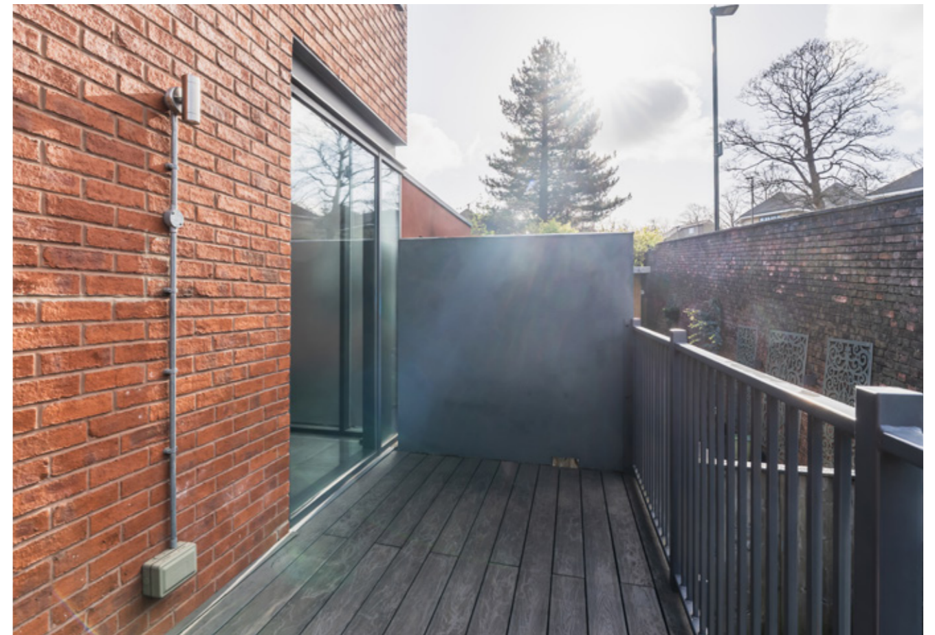
FIRST FLOOR BALCONY