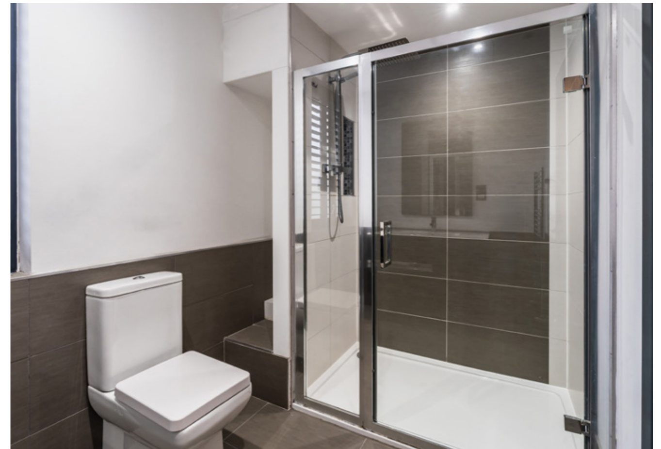
MASTER EN-SUITE SHOWER ROOM