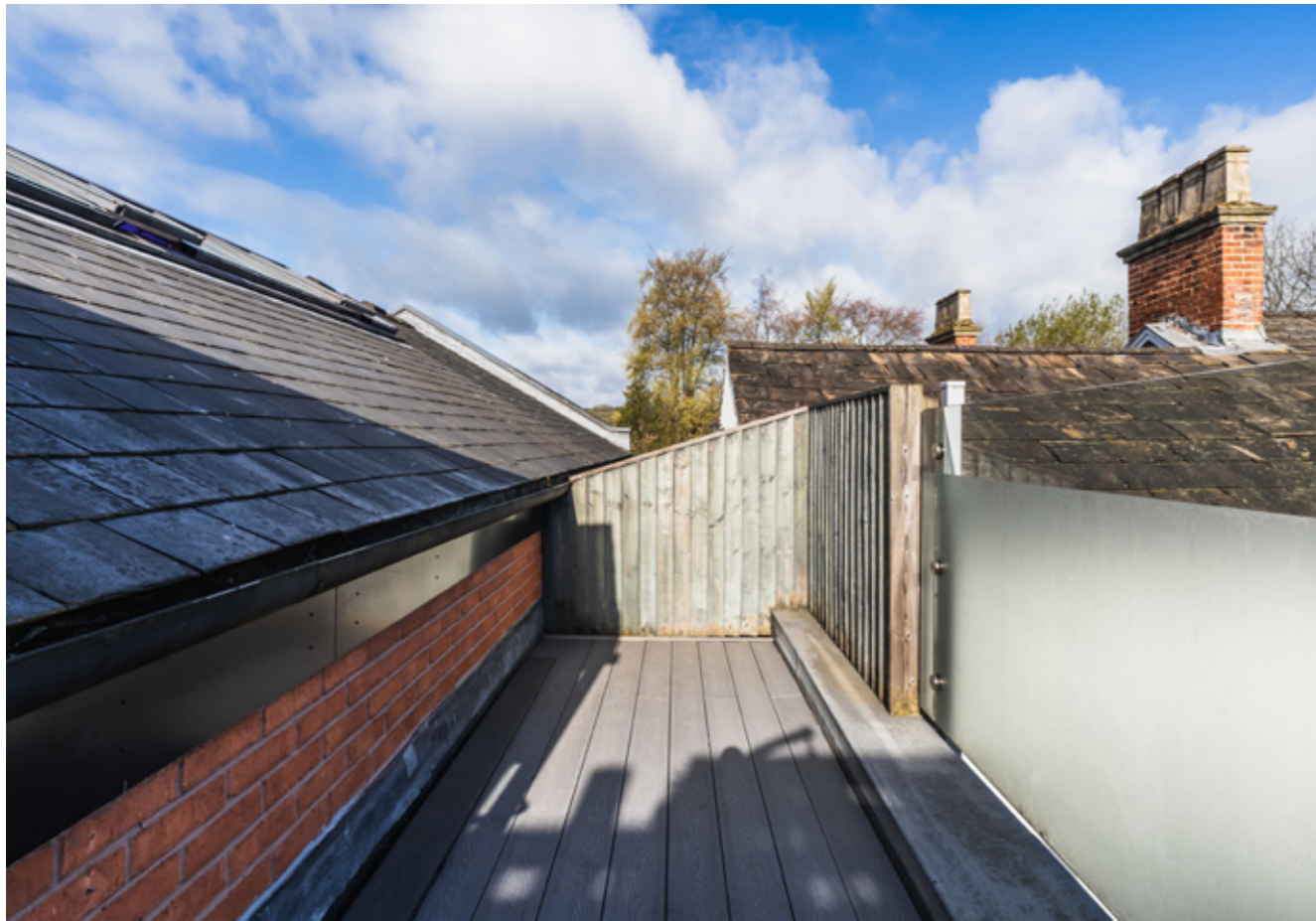
FIRST FLOOR BALCONY