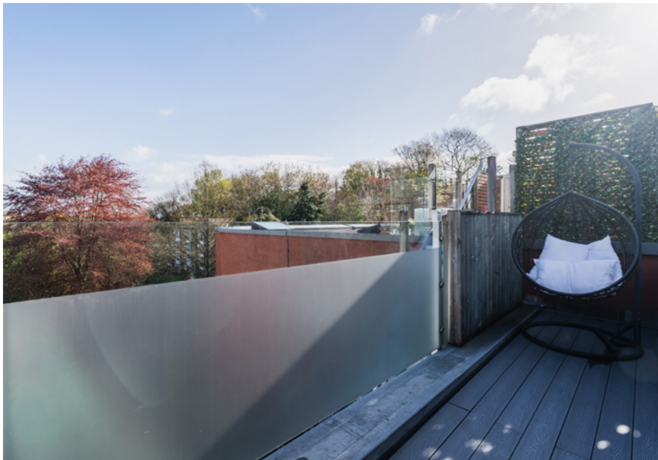
FIRST FLOOR BALCONY